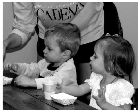
Above: The Holy Strollers group took their children to Tumbleweeds for their outing in October.