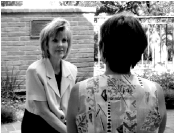
Sometimes Pastoral Care simply means listening.

son who had conducted a very successful program in Boulder, Colorado, for volunteers working in non-profit organizations. She decided that what she had been doing would be very applicable to volunteers in churches," Kohler said.