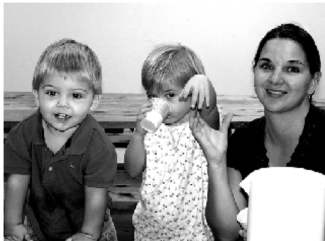
Above: One more from the Holy Strollers' gathering at Tumbleweeds.

Our Shepherd's and Noah's Ark Rooms have some additions, thanks to the proceeds from the All Things Kids Sale. We now have a new dress-up rack (complete with mirror!), a new doll house and furniture, some large soft stacking blocks and a Lego table. Come and see!